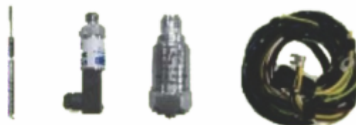
Thermocouple, Pressure Transmitter VIB Sensor, Wiring Harness